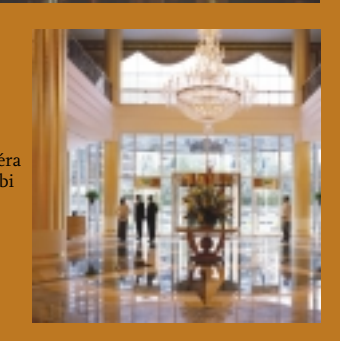
Millennium Hotel London Millennium Hotel Paris Opéra Millennium Hotel Abu Dhabi