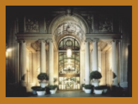
Millennium Biltmore Hotel Los Angeles The Plaza New York