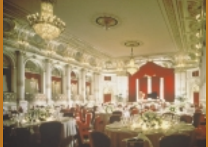
EUROPE, MIDDLE EAST